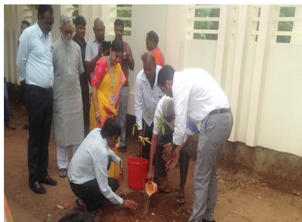
Figure 4. Sampling plantation in the campus on 15th August 2019

Placement: The Institute undertakes a broad range of vocational education, entrepreneurial training and employability skills to facilitate faster placement and better adjustment in the work situations.