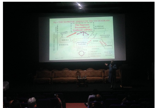
Figure 1. Lecture on correlation of Bhagavad Gita with Thermodynamics

Delivery of the Curriculum: For effective delivery of the curriculum, the faculty in advance prepares their work diary, lesson plan and course material for the teaching of the subject.